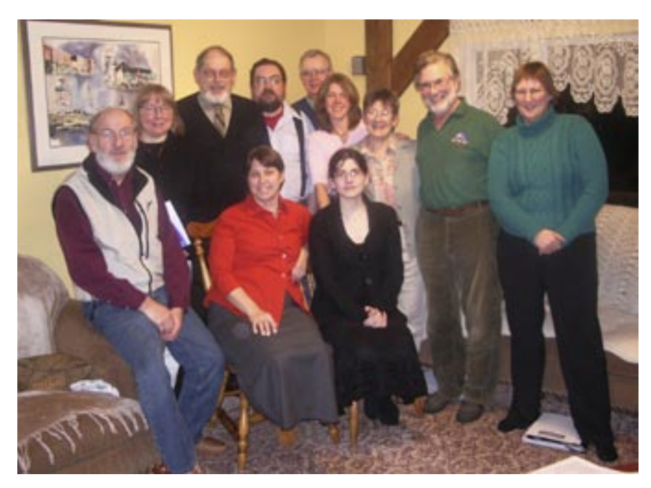
Volunteers from Saint John and Fredericton are hard at work organizing the 2006 CUC ACM.

For more about the Saint John congregation, visit: www3.nbnet.nb.ca/uucsj