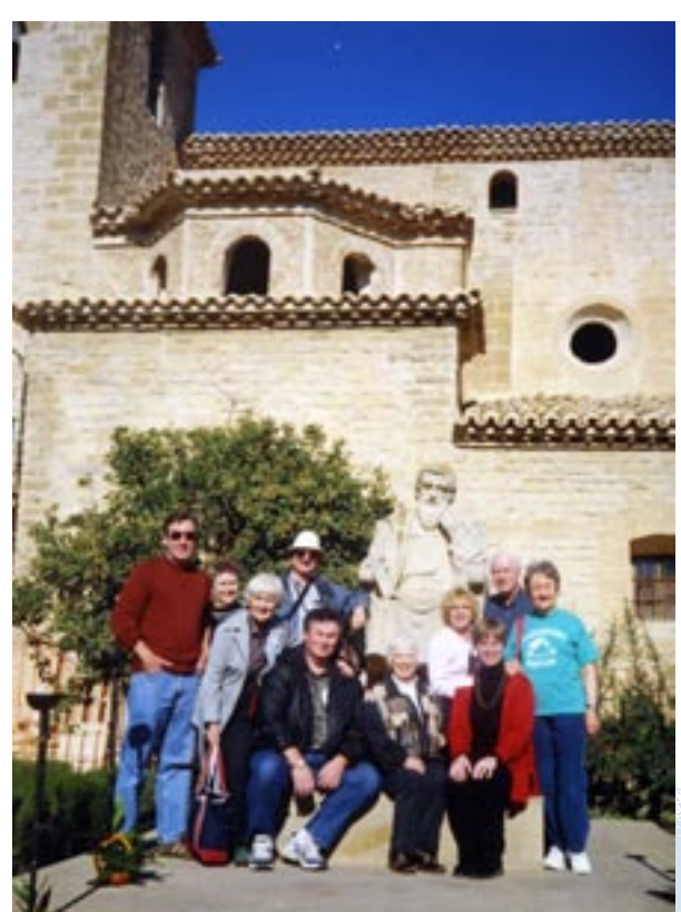
Most of the Canadian ICUU delegation surrounds the statue of Michael Servetus during a pilgrimage to his birthplace in Spain.

conference proceedings were in English, but daily worships were led by the various regions, including sections in their own languages.